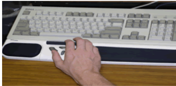
Figure 1. The RollerMouse™ by Contour Design

The devices used in this experiment were a Logitech® MX™ Optical Mouse (traditional mouse), a Logitech Marble® Mouse Optical Trackball, and the RollerMouse™ Station by Contour Design. The RollerMouse™ by Contour Design is a novel alternative pointing device that rests below the spacebar on the keyboard and consists of a rolling bar cursor control and three selection buttons. Cursor movements follow the rolling (up-down) and sliding (left-right) actions of the bar (see Figure 1). The centrally-located cursor control bar was designed to reduce repetitive reaching typical of standard mouse usage.