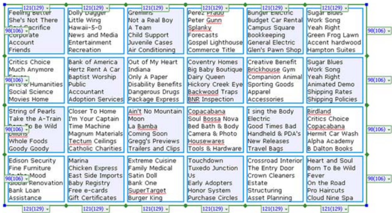
Figure 1. High overall density, medium local density screens contained 6 rows by 4 columns.

overall density screens ranged from 14-16%. High overall density screens ranged from 21-22%. Figures 1-4 show examples of four of the conditions. Each link was assigned a number and a random number generator was used to determine the target for each screen.